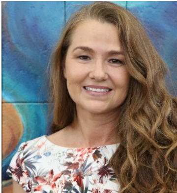
Mayor Danielle Slade